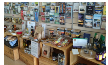
Loxton Visitor Information Centre