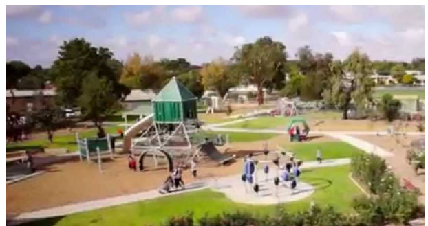
Loxton Pioneer Playground, Tobruk & Kokoda Tce, near the roundabout

A selection of items are available from the office during normal office hours, including gas swap bottles.