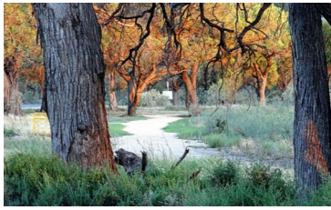
Riverfront walking trail