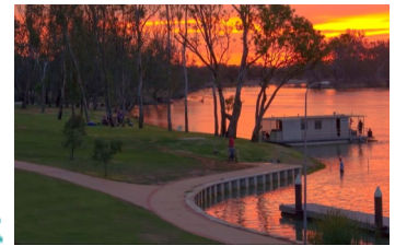
Loxton wharf and Apex Park

course is located within the park – for those who enjoy a bit of a 'hit and giggle'.