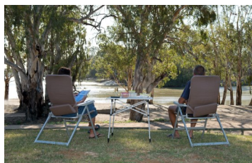
Relax on the banks of the Murray