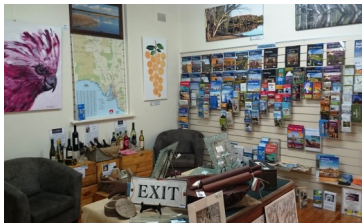
Loxton Visitor Information Centre