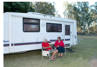
Quiet, secluded sites

Compendium: This compendium has been provided for your use and is to remain in the cabin. (A $50 fee will apply if removed or damaged).