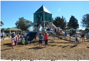
Loxton Pioneer Playground