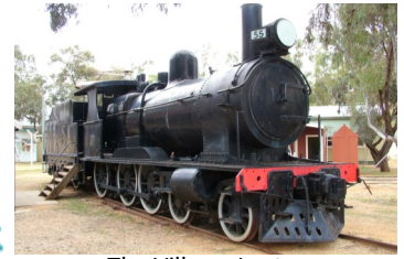
The Village, Loxton

theft, physical or verbal abuse of staff, other guests or the public. In the event of an eviction all money held will be forfeited and charges will apply for damage caused. The registered guest will not be welcome to make future reservations at the Loxton Riverfront Holiday Park.